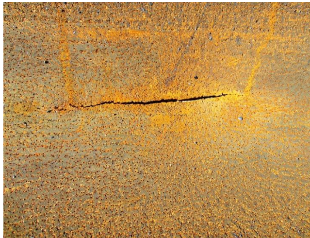
Figure4. Groove on the surface of pipeline