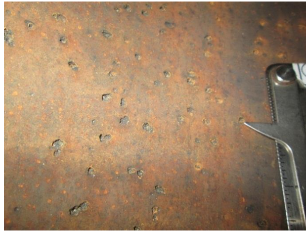
Figure6. The pitting on inner surface of straight stream of pipeline