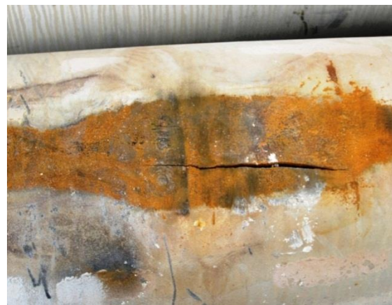
Figure1. Damaged support (left) and rupture on pipeline at 6 o' clock position (right)