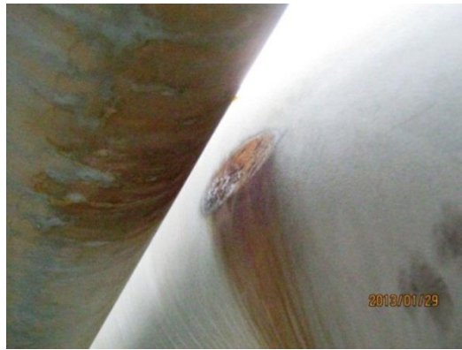
Figure2. The erosion of pipeline 16 inches on adjacent pipeline