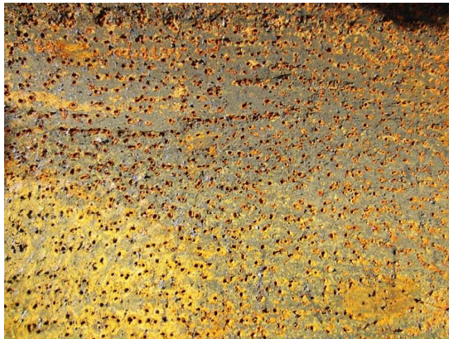
Figure3. The inner surface of pipeline