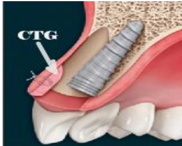
Figure 2: Diagram of connective tissue grafts buccally to dental implant.