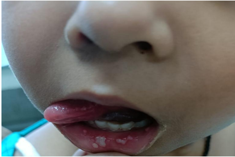
Fig. 6. Aphthous ulcer in 3-year-old baby.