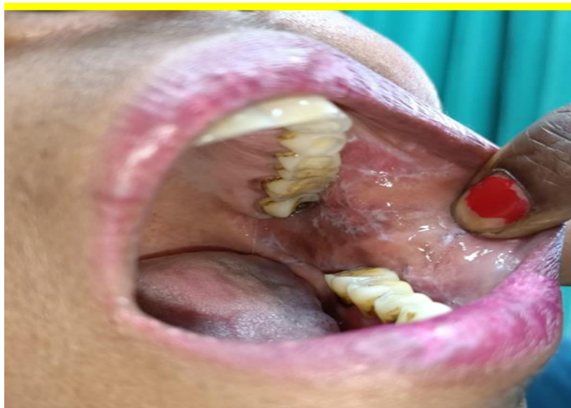
Fig. 1. Patients of oral Lichen Planus.