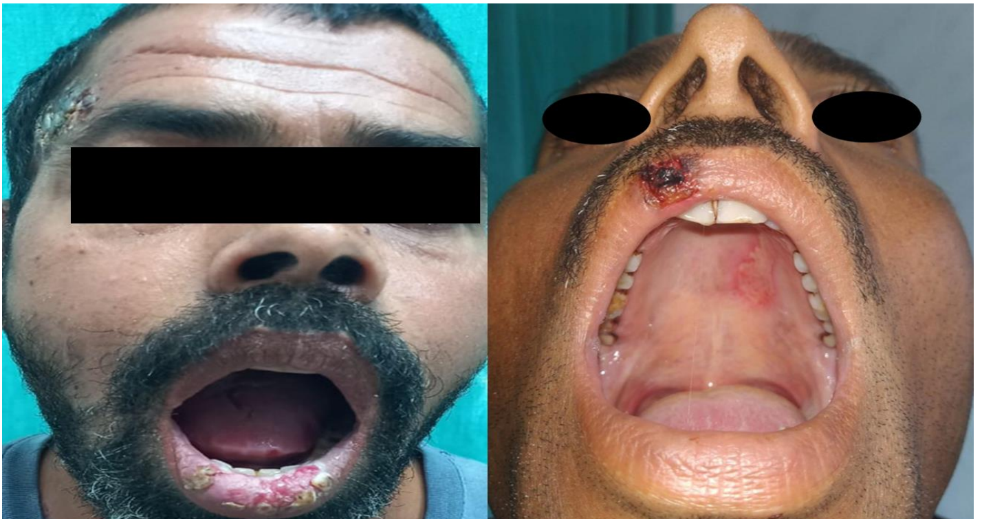
Fig. 3. Patients of Pemphigus Vulgaris.