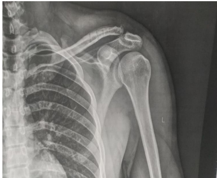
Figure 3: Last follow up x-ray of case 1.