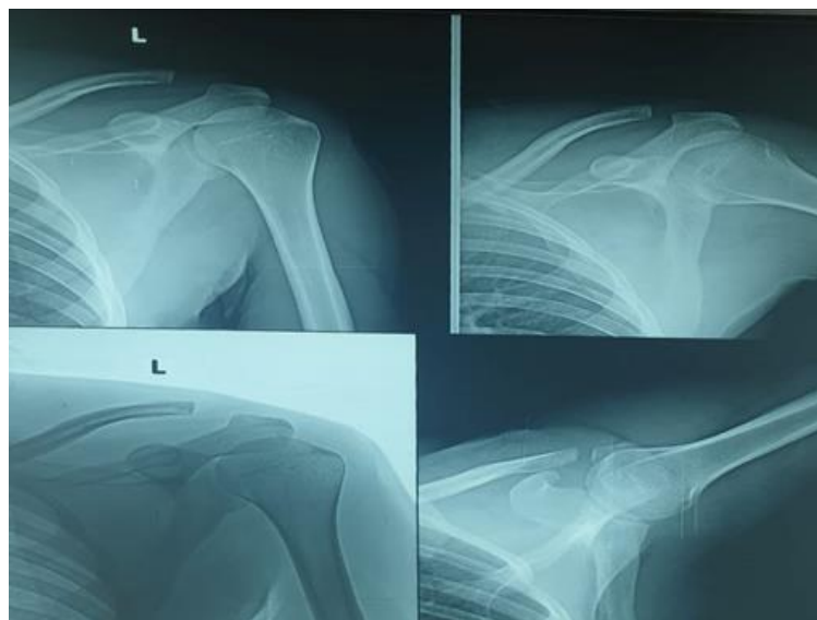
Figure 5: Preoperative x-rays of case 2.