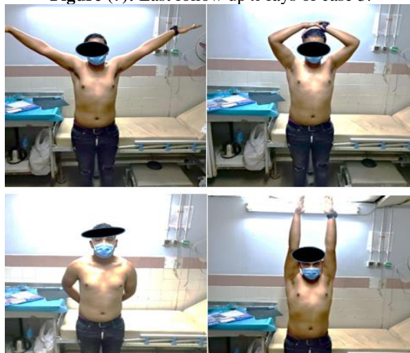
Figure 8: Last follow up ROM of case 3.