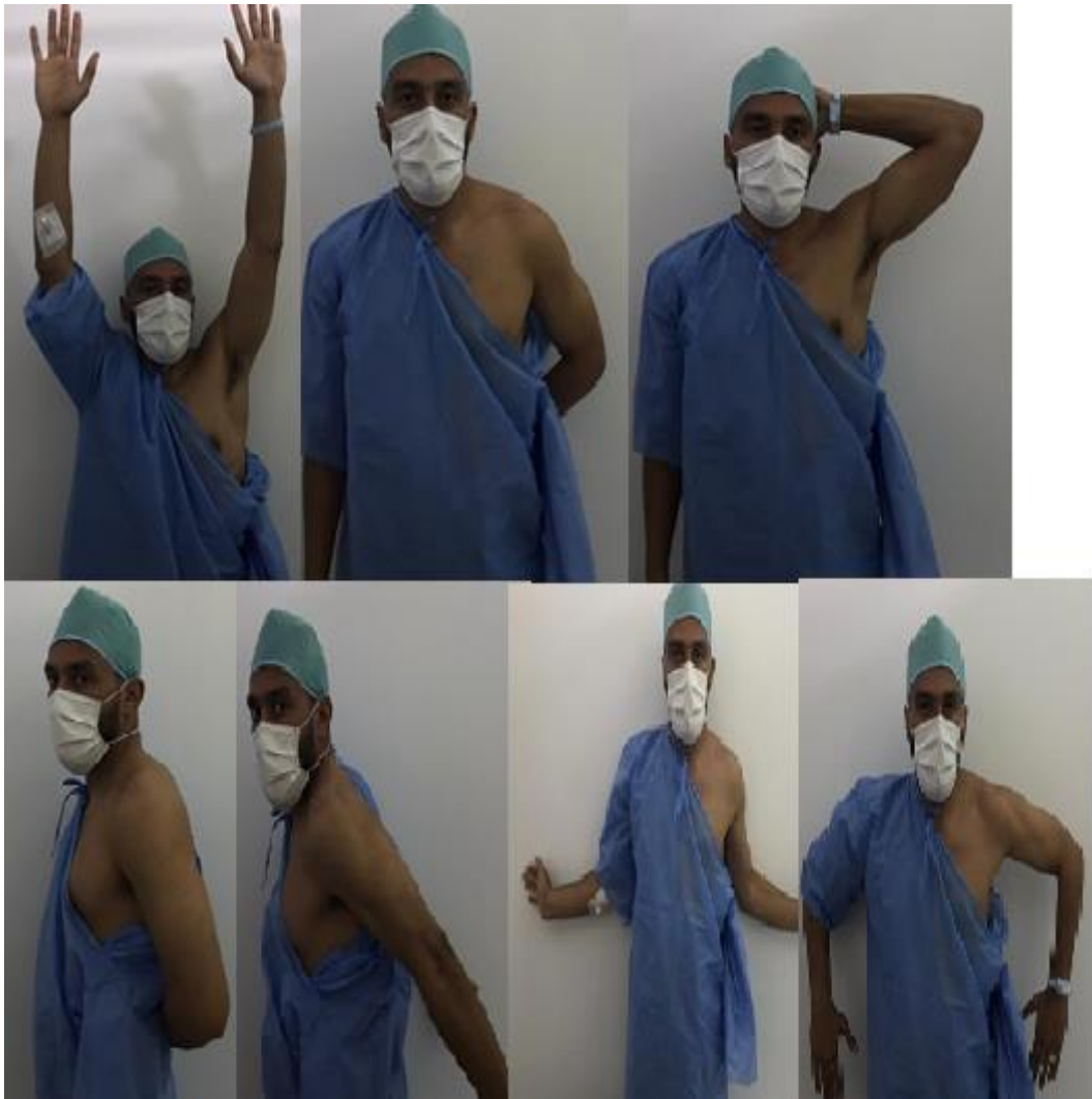
Figure 4: Last follow up ROM of case 1.