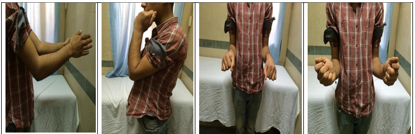
Figure 1: Clinical pre-operative ROM