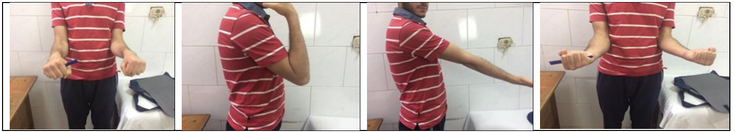
Figure 2: 6 months' Post-operative clinical photos for ROM